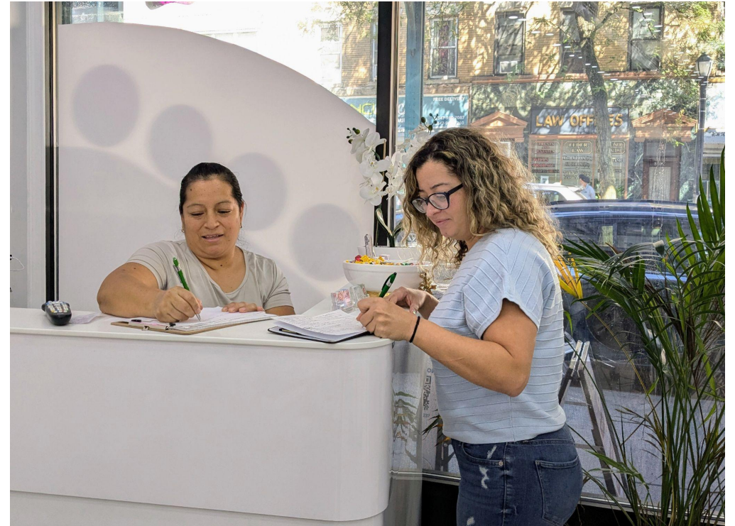
1x1 Consultation with Businesses with SBS BEST team