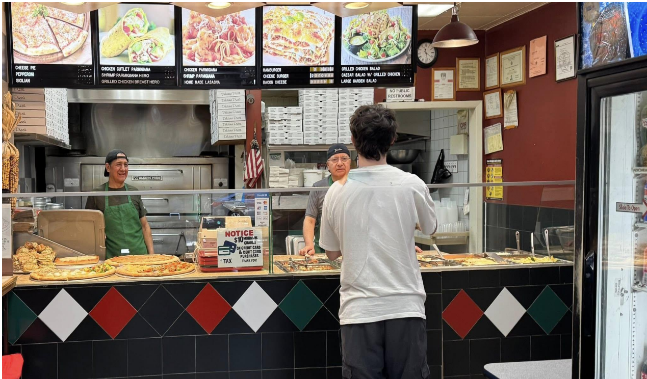
5 Merchant Spotlight Videos (La Nostra Pizza in Photo)